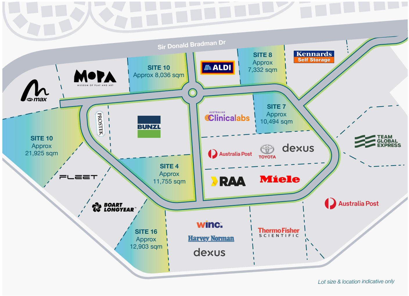
Lot size & location indicative only

With a wave of recent leasing transactions the precinct is set to welcome a new generation of forward thinking occupiers from late 2026.