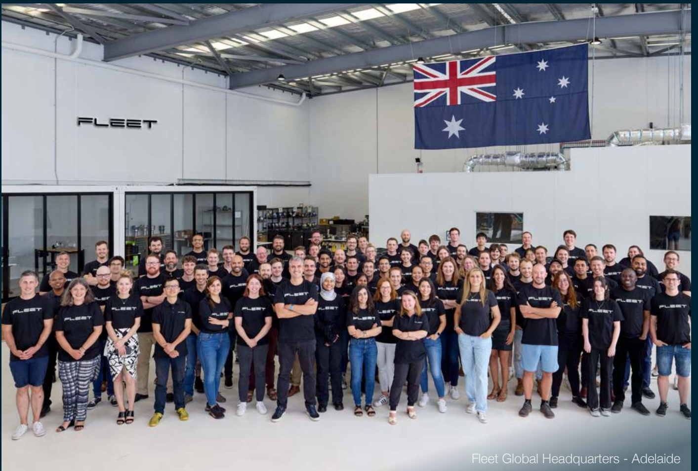
Fleet Global Headquarters - Adelaide