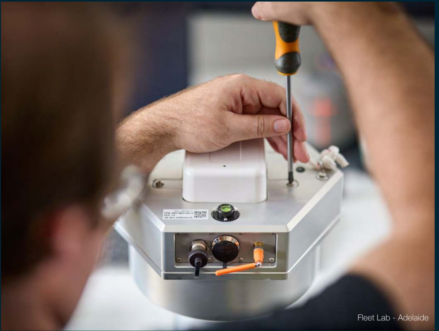
Fleet Lab - Adelaide